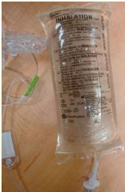
Figure 1. Sterile water 1,000 mL bag for inhalation (CareFusion) looks similar to 1,000 mL IV solutions.

This was the second of two reports we received involving CareFusion sterile water for inhalation. The CareFusion sterile water for inhalation flexible bags ( Figure 1 ) look very similar to IV solutions in 1,000 mL flexible bags, with similar black printing on the labels. While the word "inhalation" appears various times on the label, it is easy to misidentify the sterile water for inhalation as a standard IV solution, especially in an emergency situation.