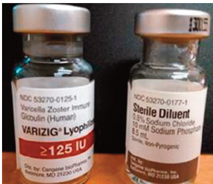
Figure 1. Lyophilized VARIZIG and diluent.

Recently, in a US hospital emergency department (ED), a 5-year-old pediatric patient was to receive 125 units IM. However, a nurse misunderstood the instructions and used the entire volume of diluent (8.5 mL) to reconstitute the product. Rather than waste the dose, the nurse decided to divide the dose into two 3 mL injections and one 2.5 mL injection—for a total of 3 IM injections, which is bound to be traumatizing, particularly for a 5-year-old child. It is unclear why the instructions were misunderstood, but since only a fraction of the diluent (1.25 of the 8.5 mL) is necessary, it is likely that the packaging contributed to the error. We could also foresee a situation where the entire diluent is used to reconstitute the powder, and the practitioner assumes this provides the labeled 100 units per mL concentration, which would lead to a subtherapeutic dose.