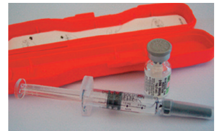
Figure 1. Lilly's Glucagon Emergency kit.

administered a dose measured in units because the label on Lilly's Glucagon Emergency Kit (Figure 1) and vial indicates the dose is "1 mg (1 unit)." The nurse was new and had never administered glucagon. He said he used a U-100 insulin syringe to administer the 1 unit dose each time. He did not realize that "1 unit," in this case, meant a full mg as indicated by the marking on the syringe contained in the kit. The patient had received only 1/100 of the required dose, even though a pharmacy label on the product said, "Inject 1 mg (1 unit) subcutaneously every 15 minutes as needed if blood glucose is less than 60 mg/dL and patient unable to take glucose products by mouth." Apparently, the nurse became confused when he saw "1 unit" and used an insulin syringe to measure each dose.