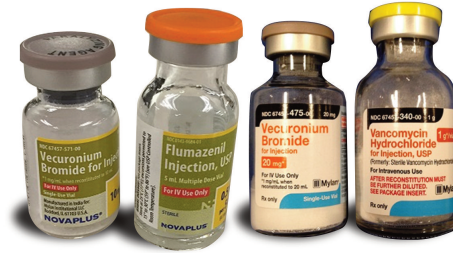
Figure 1. Once the caps are removed, these vials look very similar. However, a mix-up could be catastrophic.

Similar colors and label graphics contribute to Mylan's vecuronium 20 mg and vancomycin 1 g vials looking alike ( Figure 1 , right two vials), especially with the caps removed. Both contain white lyophilized powder that requires reconstitution.