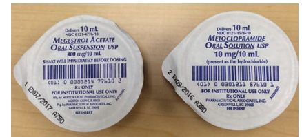
Figure 1. These two containers look alike and could be easily mixed up.

automated dispensing cabinet (ADC) was incorrectly stocked with metoclopramide 10 mg/10 mL oral solution. Both products are distributed by Pharmaceutical Associates. The nurse retrieving the medication for her patient recognized the stocking error and informed the pharmacy. Related to the dispensing error, megestrol and metoclopramide oral liquids are stored in the pharmacy in bins that are right next to one another. Also, both medications deliver 10 mL and are available in very similar dosing cups, with