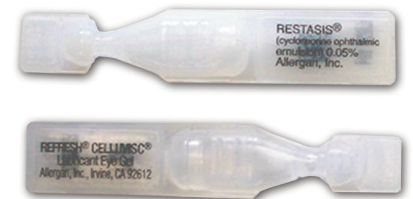
Figure 1. Plastic ampuls of Restasis (top) and Refresh Celluvisc (bottom) can be easily mixed up.

Errors can still happen when barcode labels are placed on the container by pharmacy. In the case just mentioned, the barcode label for Refresh Celluvisc was incorrectly placed on the Restasis product by pharmacy. Not only is the packaging identical but the text on the unit dose package also looks similar ( Figure 1 ). We have asked both the US Food and Drug Administration (FDA) and the manufacturer to look into the situation. The FDA barcode