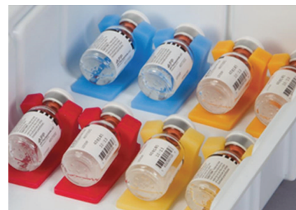
Figure 1. “Vial grippers” (Health Care Logistics) can help keep the labels on vials facing forward. (Labels are facing away in the photo but should be facing forward to improve vial identification.)

1 Safer drug storage. We like an idea for drug storage that we just saw in a Health Care Logistics advertisement. The company sells what they refer to as “vial grippers” that help to “neatly organize medication vials lying flat inside a code cart box or drawer and keep labels facing up so they are easy to read, which may help prevent errors when obtaining medications” ( Figure 1 ). Without doubt, one of the most common errors reported to the ISMP National Medication Errors Reporting