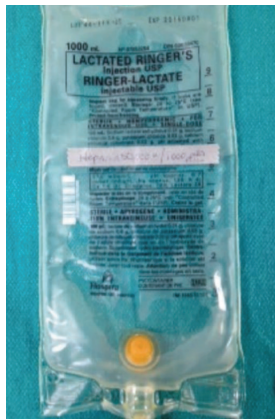
Figure 1. Gray tape label on bag of lactated ringer's (from Canada) with added heparin is poorly visible.