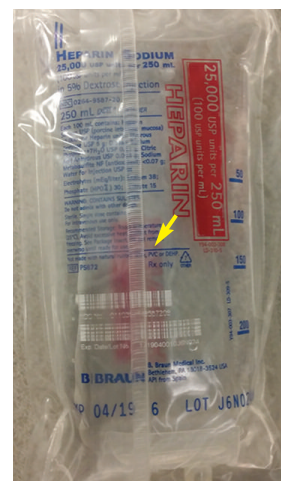
Figure 1. Crimped seam on plastic heparin premixed bag overwrap interferes with barcode scanning.

⚡ Scanning difficult through IV bag overwrap. We have received several complaints about the position of a seam on the protective overwrap of B. Braun heparin premixed solutions. Hospital staff often scan the barcode on heparin bags when restocking automated dispensing cabinets to ensure that the bags are placed in the correct stock location. The