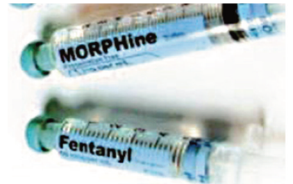
Figure 1. Color-coded syringes for classes of drugs can lead to errors outside the operating room.

If a shortage occurs, some hospitals may seek product from external compounding companies, which would need to use commercially available vials to prepare syringes or begin with active pharmaceutical ingredients. However, these companies can only