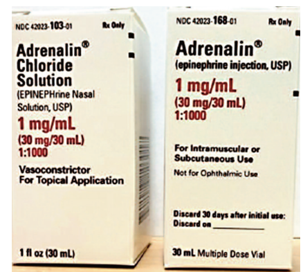
Figure 1. Adrenalin nasal solution (L) is easy to confuse with Adrenalin injection. Par Pharmaceutical will be changing the nasal solution label text to blue.

Routine storage of 30 mL vials of EPINEPHrine outside the pharmacy should be avoided when possible. If vials of the nasal solution, which are only available in 30 mL containers, are necessary in patient care units, consider affixing a large “external use only” auxiliary label to reinforce proper use. As for 30 mL multiple-dose vials of EPINEPHrine injection, these are a set-up for 10-fold dosing errors because the labels continue to include a ratio expression (1:1,000). We have asked Par Pharmaceutical to change that to comply with USP <7>, which calls for elimination of ratio expressions. There is enough volume in a 30 mL vial to administer a fatal overdose. Barcode scanning at the point of care can also help detect wrong product errors before they reach patients.