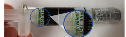
Figure 1. Afluria syringe with peel-off labels intact makes syringe label difficult to read.

most users who hold syringes by the plunger with their right hand ( Figure 2 ). The product is available in cartons that are well labeled and hold trays with 10 syringes. To help ensure the product is properly labeled and identified, we recommend storing the carton in the refrigerator, with the trays remaining inside the carton. Nurses and assistants who administer vaccines should be reminded to maintain storage in the original cartons. ISMP has contacted Seqirus, the product manufacturer, about these labeling issues.