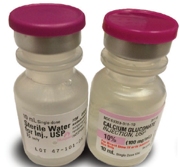
Figure 1. Photo shows similarity of plastic vials of sterile water (left) and calcium gluconate (right).

that calcium gluconate 1 g/10 mL from Fresenius Kabi is available in plastic vials instead of the previous glass vials. Although the label appearance has not changed, the product now appears similar to vials of 10 mL sterile water for injection from Hospira. Each vial is about the same size, with a similar cap color ( Figure 1 ). We had also received a report regarding similarities between the Fresenius Kabi's 10 mL vials of calcium gluconate and the company's