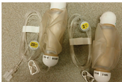
Figure 1. Easypump devices in 250 mL per hour (left) and 2 mL per hour (right) configurations. The flow rate marking, highlighted in yellow on both devices, was missed by several healthcare professionals who handled the pump.

Last month, we learned about an error involving a patient who was to receive 4,000 mg of fluorouracil by IV infusion at 2 mL per hour over 4 days, but he accidentally received the entire 4-day dose in less than 1 hour. The error was caused by a mix-up between an EASYPUMP (B. Braun) elastomeric infusion pump that infuses 2 mL per hour with one that infuses 250 mL per hour ( Figure 1 ). The Easypump, used mainly in the home, is available in 19 different volume and flow rate combinations for short- and long-