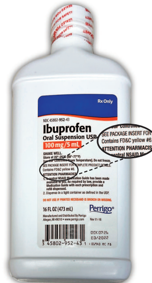
Figure 1. The principal display panel on a large bottle of ibuprofen oral suspension from Perrigo indicates that it "Contains FD&C yellow #6," but the product also contains D&C red #33, which is only listed in the package insert.

> SAFETY briefs cont'd from page 1 sharply embossed, and easily understood." For this product, that requirement is not met.