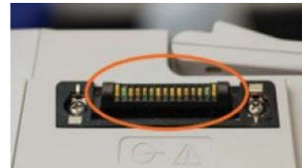
Figure 1. Inspect the IUI connectors on BD Alaris PCU and modules for contaminants, blue or green deposits, or cracks.

BD recommends inspecting IUI connectors ( Figure 1 ) on each device before every use and if any surface contaminants or cracks are visible, the device should be sent to clinical/biomedical engineering to replace the IUI connector. It is also important to review resources provided by BD to facilitate appropriate cleaning ( www.ismp.org/ext/1121 , www.ismp.org/ext/1122 , www.ismp.org/ext/1123 , www.ismp.org/ext/1124 ).